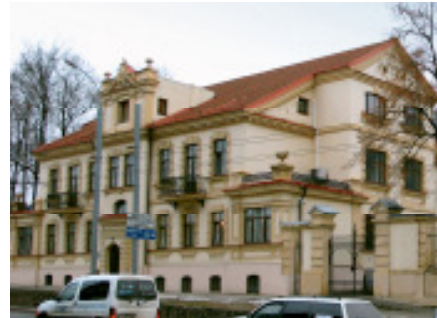
Lithuanian Road Administration in Vilnius, Lithuania

Q: What is your name and for which organization do you work?